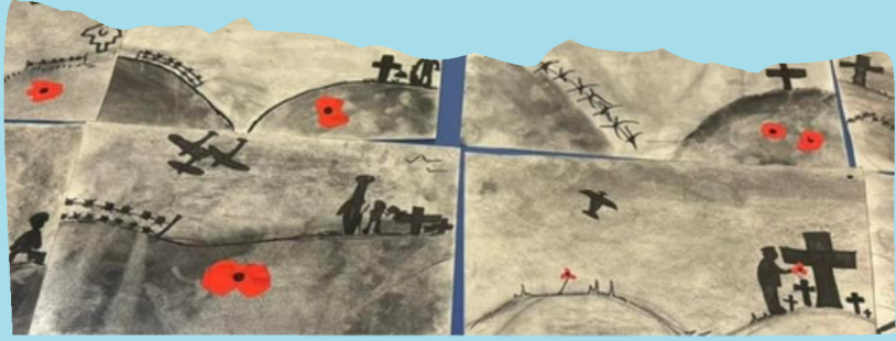
Year 6 Remembrance Day art work was both moving and beautifully done.