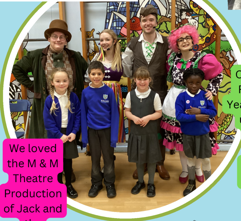
We loved the M & M Theatre Production of Jack and the Beanstalk!