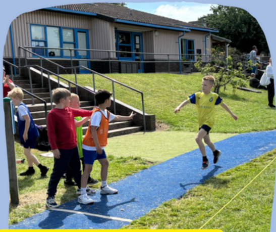
The long distance relay is a challenge for many children!