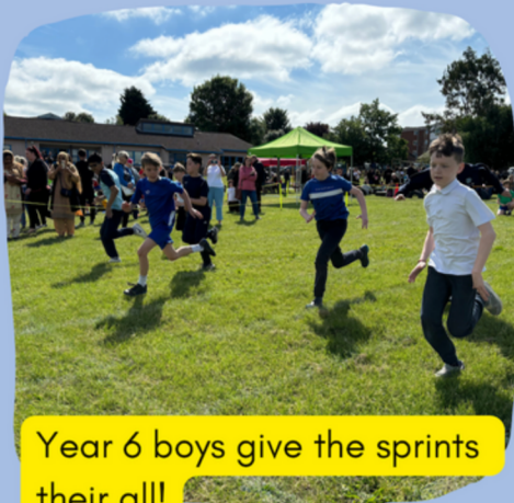
Year 6 boys give the sprints their all!