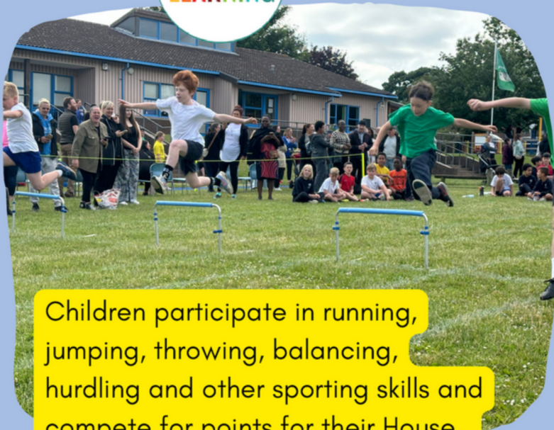
Children participate in running, jumping, throwing, balancing, hurdling and other sporting skills and compete for points for their House.