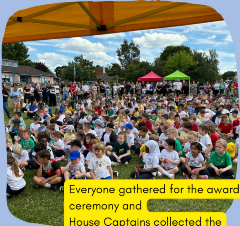
Everyone gathered for the award ceremony and House Captains collected the trophy on behalf of their team!