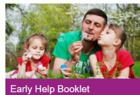
Early Help Booklet

Early Help in Worcestershire have created a booklet to help families find out about the help and support available in the county for children and young people aged 0-18 years old. The new booklet will help you and families find the most appropriate support.