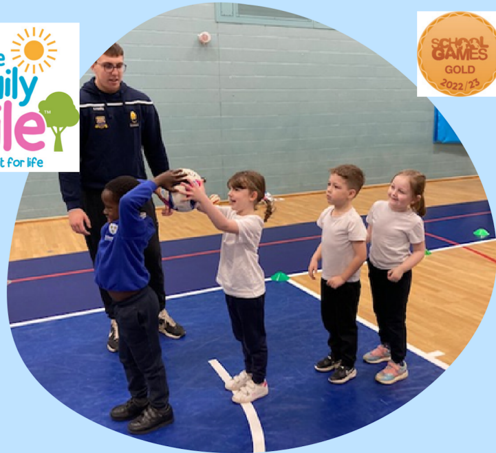
Year 1 children have attended their first Multiskills event at Worcester University Arena and had a superb time working with sporting role models, playing games and learning new skills.