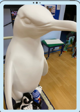
Our penguin arrived and is waiting for his new design...

City and Wolves Houses came joint first in the House Dodgeball event. This is the first time two Houses have drawn. The trophy was collected by the House Captains