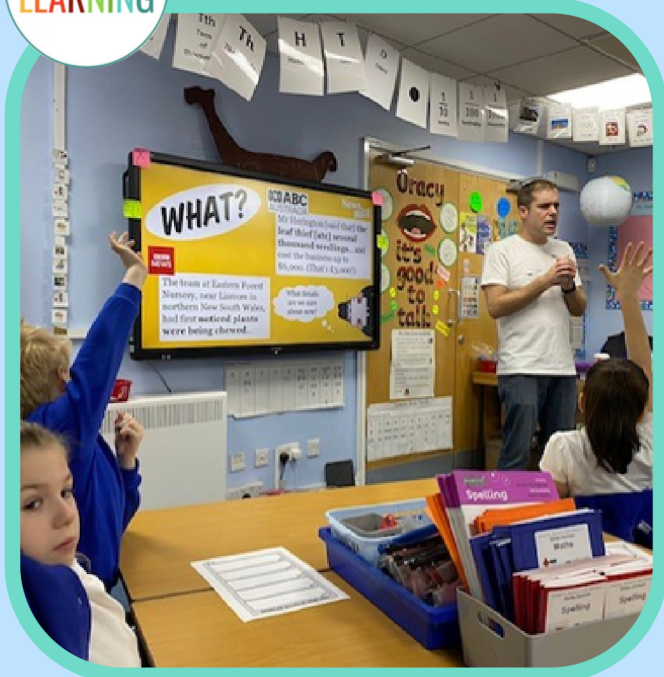
Year 4 have been learning about fake news and how to start to understand whether a source is reliable or not with The Guardian Newswise workshops.