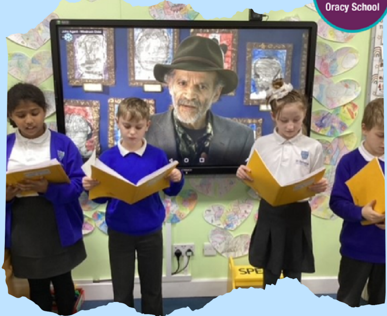
Year 5 children are using their fantastic oracy skills having been inspired by their work on Windrush and reading quality texts such as John Agard's Windrush Child.