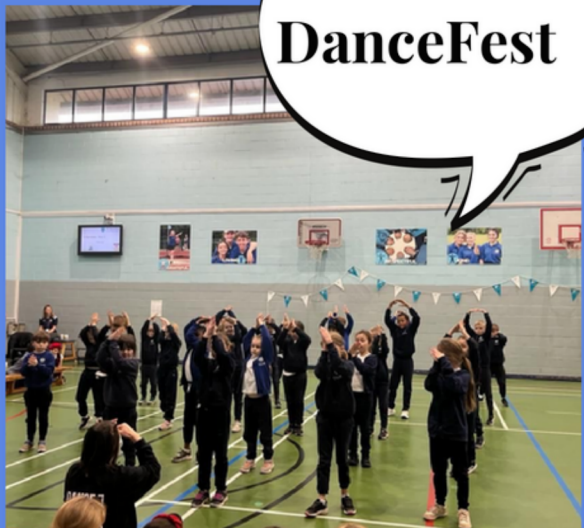
Year 3 at DanceFest