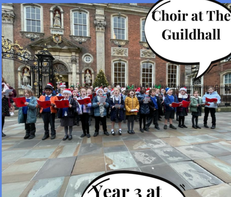
Choir at The Guildhall

Our children have been given many opportunities to showcase their performance talents this week...check out this performance gallery of pictures