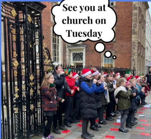
See you at church on Tuesday