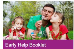
Early Help Booklet

Early Help in Worcestershire have created a booklet to help families find out about the help and support available in the county for children and young people aged 0-18 years old. The new booklet will help you and families find the most appropriate support.