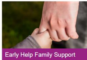
Early Help Family Support