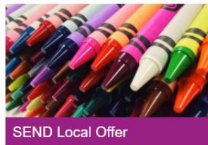
SEND Local Offer