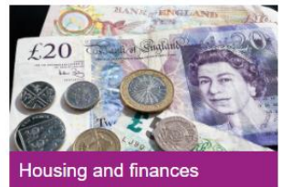
Housing and finances

The Online Family Hub has been developed to provide you with a range of different types of resources that are available to you online, on the phone or face to face that you can access directly.