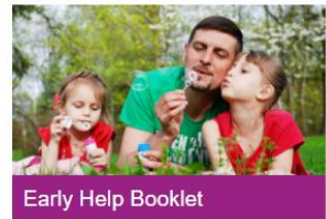
Early Help Booklet

Early Help in Worcestershire have created a booklet to help families find out about the help and support available in the county for children and young people aged 0-18 years old. The new booklet will help you and families find the most appropriate support.