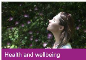
Health and wellbeing