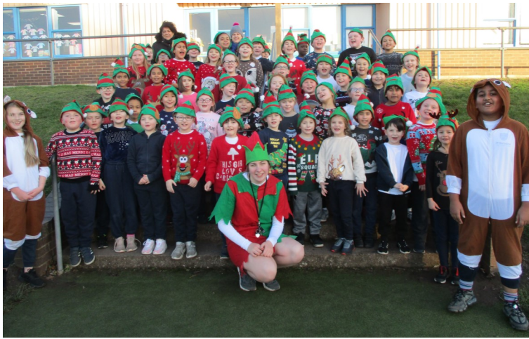
Year 3 loved their Elf Dash!