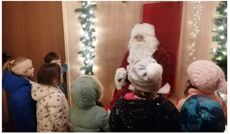
Year 1 loved their trip to Smart Trees and saw Father Christmas, his elves and reindeer and then the Big Man himself came to see Reception children at school too!