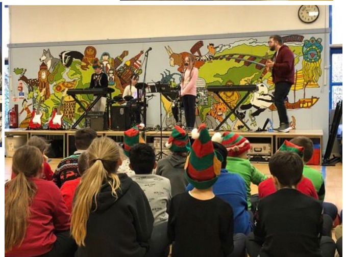
We had our own Christmas rock band with Rocksteady, performing live to Year 5! There was even some cheeky comedy thrown in..