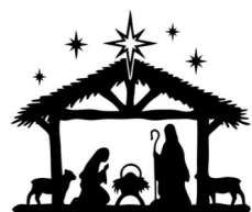
Children have enjoyed creative Christmas art at school and celebrating the birth of Christ.