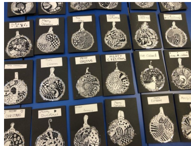
Superb art work from Year 6 in class and after school at Art Club