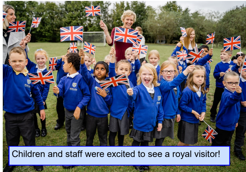
Children and staff were excited to see a royal visitor!

Many visitors praised our children's immaculate behaviour and polite manners.