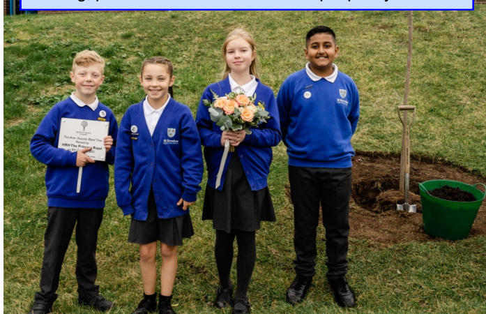
School Council Officers talked to HRH about outdoor learning, presented flowers and set the plaque by the tree.

These pictures capture a little bit of the excitement of the day! Waiting for the helicopter to arrive, then seeing it appear in the sky was breath-taking!