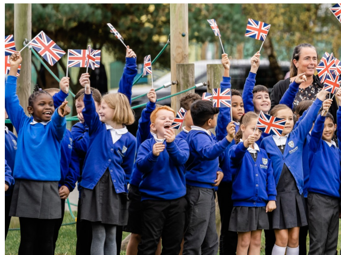
Pre-School children with their flags!